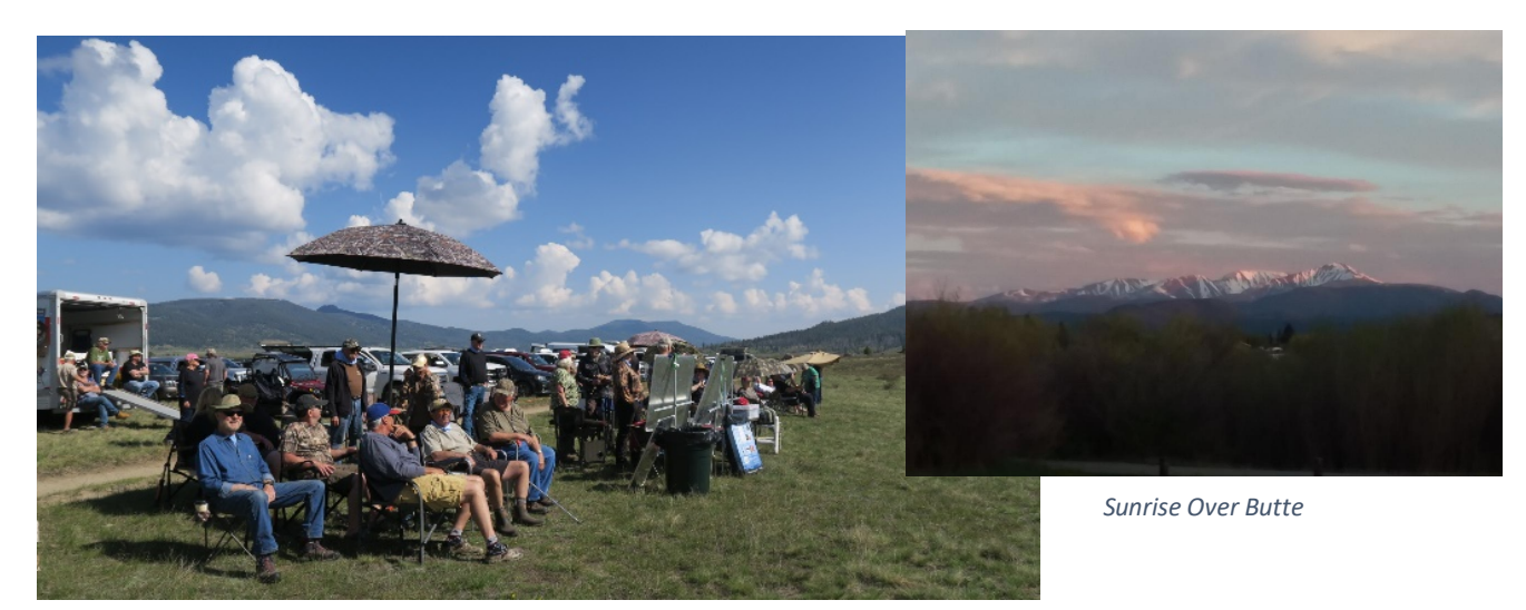
Chatter in the Gallery

Many thanks to all who participated, worked and supported the event. A special call out goes to the Treasure State Retriever Club for their hospitality and hard work.